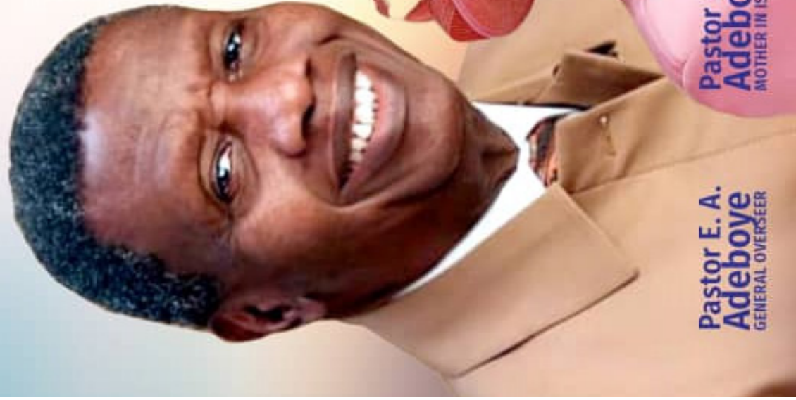
Pastor E. A. Adeboye GENERAL OVERSEER

THE AMERICAS CONTINENT 2 INTERNATIONAL CONVENTION